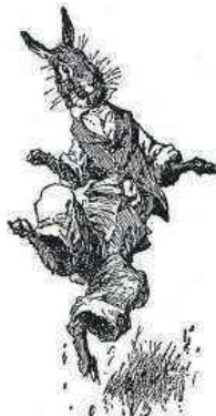
Brer Rabbit-A.B. Frost 1896

April 19th, 2024 - 7 PM Pacific Daylight Time on Zoom